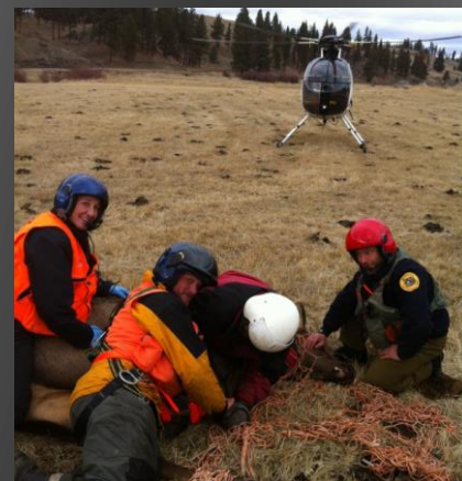
Montana Biologist working with Quicksilver to capture a cow elk