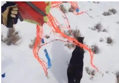
A perfectly placed shot, this Moose will soon be yet another animal captured

We wish we had room for pictures from all projects. Thanks to everyone for your business. Looking forward to working with our loyal lower 48 clients again.