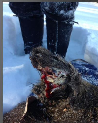
Carotid Artery worms (Elaephora Schneideri) can block the vessels in moose ears and cause them to freeze off. These are just one of many deadly parasites Quicksilver's crews check wildlife for.