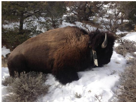
A large Plains Bison bull collared by Quicksilver Air's Crew

Sheep, moose, deer, wolves, bison, goats, owls, coyotes, pronghorn, elk, wolverine, musk ox, bears, and caribou.....By chemical immobilization or the net, we have caught them all. There is simply no other U.S. company that captures and takes biological samples on the variety of natural wildlife species that Quicksilver does on a regular basis and YEAR ROUND.