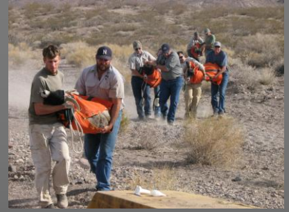
Desert bighorn sheep capture, River Mountains, Nevada 2008