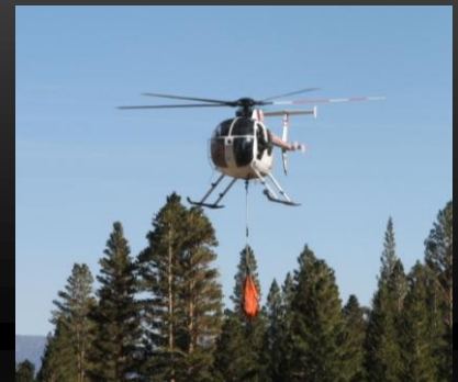
Sierra Nevada bighorn sheep capture up to 13,000 ft; California, October 2008