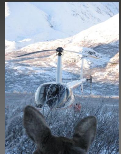
Moose capture, Alaska, November 2008