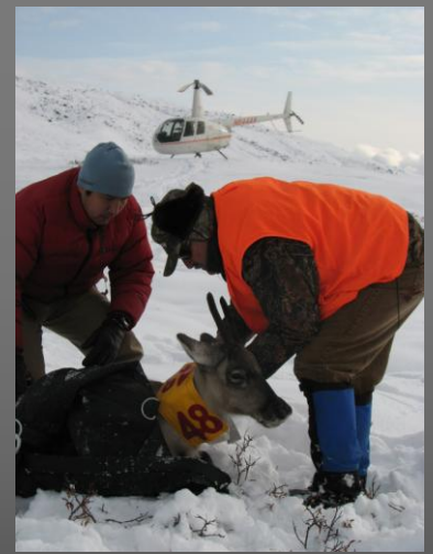
Caribou capture, Alaska, September 2008