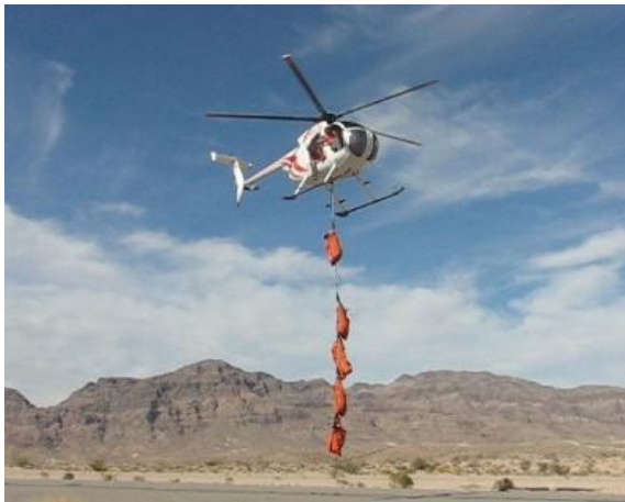
Desert bighorn sheep capture, Muddy Mountains, Nevada, October 2008