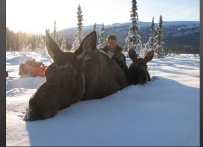
Moose capture, Alaska, November 2008